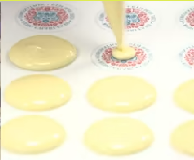
Crowned by chocolate: Sweet treats to commemorate King's coronation