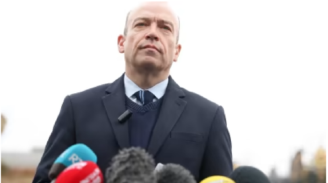
Leadership needed to 'get finances in order': Heaton-Harris