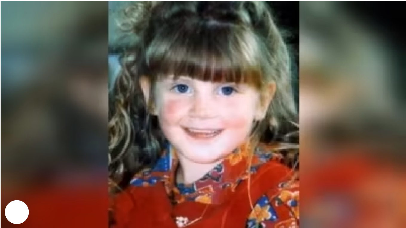
Family's 'long and painful journey' after girl's death